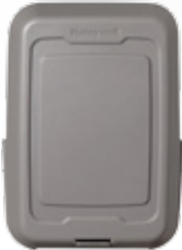
Wireless Outdoor Air Sensor