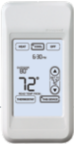
Portable Comfort Control™

Property managers can remotely monitor and control their heating and cooling systems anytime, anywhere. Free apps are available for both Apple® and Android™ devices.