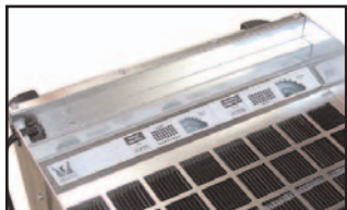
Bypass closed (normal temp operation).

Below 50°F - When the Phoenix 200 HT is used in very cool operating temperatures (below 50°F), frost will form on the evaporator coil as it dehumidifies. When enough frost forms, the defrost thermostat will initiate the timed defrost cycle. The cycle periodically turns off the compressor while allowing the blower to run. The grain control magnet should cover the bypass openings in this operating range because the increased airflow and static pressure will help defrost the evaporator more quickly and efficiently.