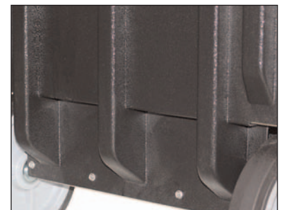
A skidplate protects the Phoenix 200 HT from damage while loading, unloading and in transport.

The Only Choice for Restoration Professionals