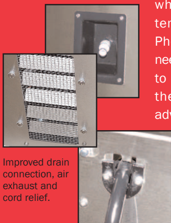
Improved drain connection, air exhaust and cord relief.

The Phoenix 200 HT's ability to perform in temperatures above 90°F offers two major advantages over other standard LGR's. First, drying at higher temperatures speed the evaporation of moisture in the structure when compared to cooler temperatures. Second, the Phoenix 200 HT reduces the need to remove drying equipment to control temperature inside the affected area. Both advantages lead to faster drying and happier customers.